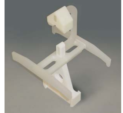
9054: Transfer Rack