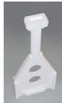
9423: Wafer Rack