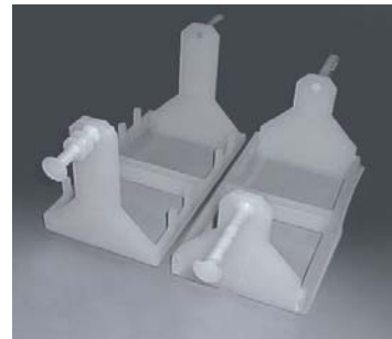
8998: Megasonic Racks