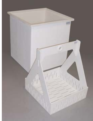
9500: Tank and Basket