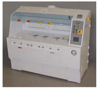
0187 Acid Bench