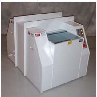
9052: Wet Pass-Thru