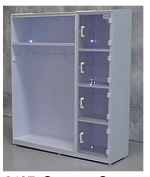
9137: Garment Storage