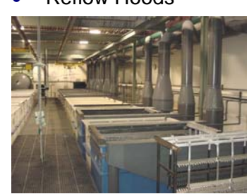
Shop Exhaust Systems