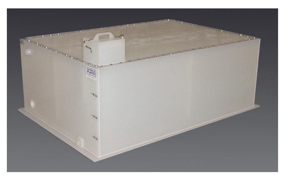
9184: 300* Gallon UV Resistant Copolymer Polypropylene