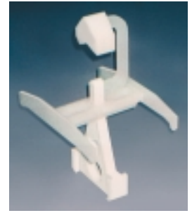
WAFER BOAT RACK