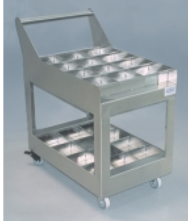
STAINLESS STEEL BOTTLE CART