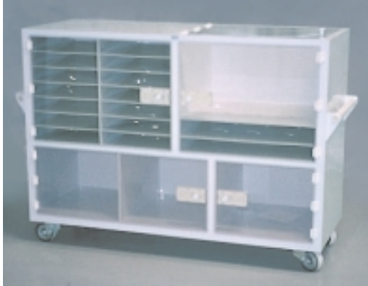
WIP TRANSPORT CABINET