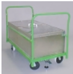
LARGE SS BOTTLE CART