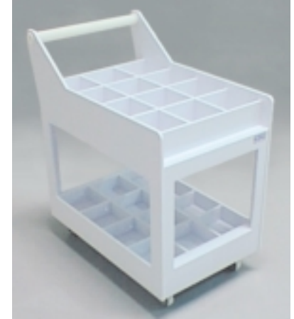
POLYPROPYLENE BOTTLE CART