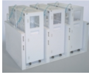
QUARTZ TRANSPORT CARTS AND DOCK

Clean Room Carts & Carriers are available in standard designs or can be built to your specifications. Many construction materials are available, including polypropylene, polycarbonate, stainless steel and static dissipative materials