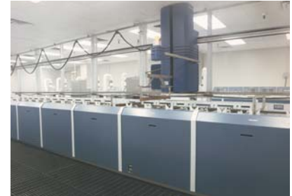
Automated Plating Lines