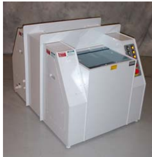
9052: Wet Pass-Thru