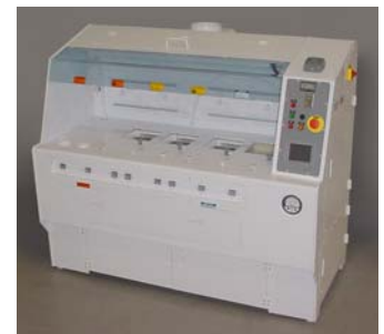
0187 Acid Bench

© 2008 Leatherwood Plastics All specifications are subject to change without notice.