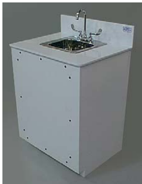
8716: Sinks & Tables