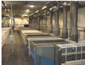
Shop Exhaust Systems