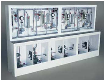
Chemical Mixing Station