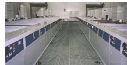
Custom Surface Finishing Equipment