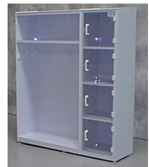
9137: Garment Storage