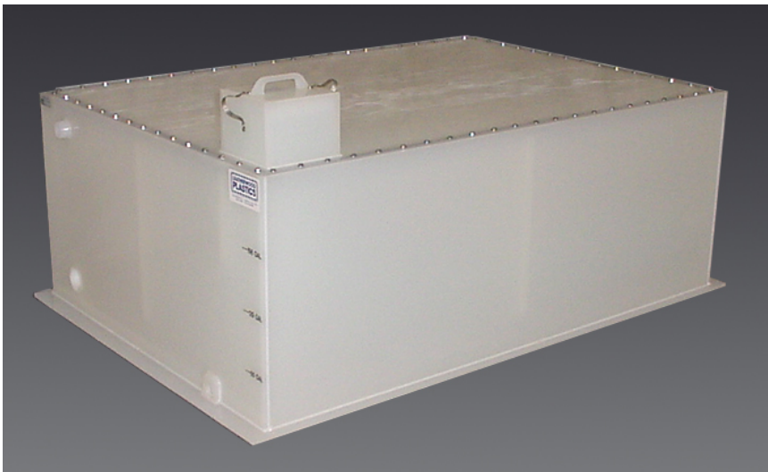
9184: 300* Gallon UV Resistant Copolymer Polypropylene